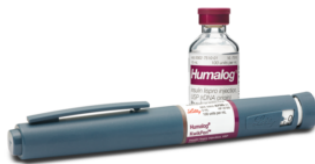
Insulin Vial or Pen