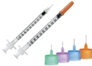
Syringes or Pen Needles