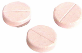
Fast Acting Carb