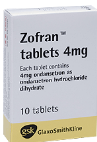
Zofran (Ondansetron) for vomiting

You'll need a bag to carry all of these supplies. The good news is, you have many options. Small backpacks can be found at stores like Target or Claires or at online diabetes supply stores like Myabetic , Sugar Medical , Pump Wear and Fifty50 Medical (half of their profits fund diabetes research) . Since this is a bag that your child will take everywhere, choose something that suits their style as there are many fashionable options available.